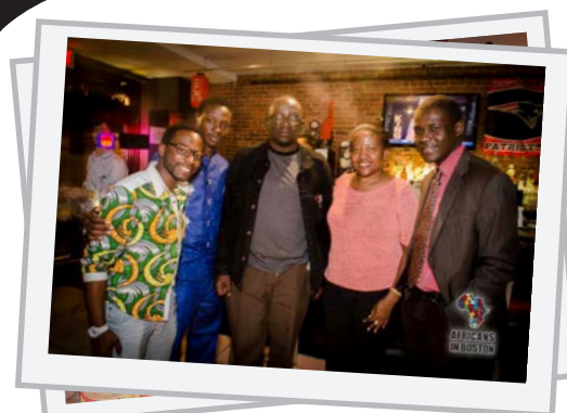
Our team with officials from the Uganda National Association 05/27/2012

Next Hakuna Sundays: Sunday June 10, 2012 at 6pm at Itadaki Lounge (269 Newbury St. Boston) Join us for another exciting event , come have a drink, mingle and meet new friends.